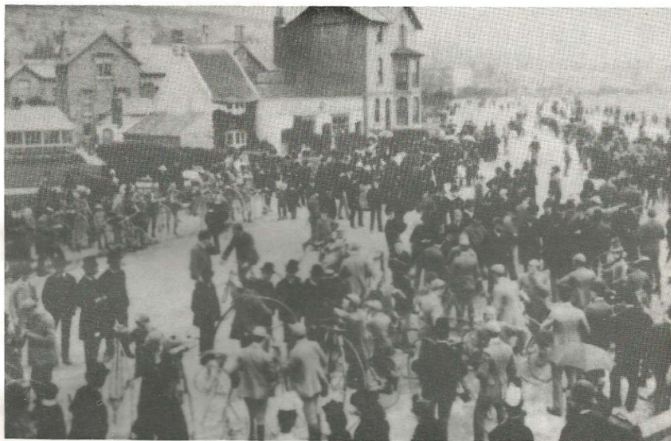
Cycle meeting about 1888 on sea front outside Leeves' cottage. There are nearly 60 cycles — about 30 ordinaries (or penny farthings), 13 rear-drive safeties, 7 tricycles and one "kangaroo". Cycling became popular in the 1870s and the Weston-Super-Mare Cycling Club was founded in 1878. An 1889 advertisement lists amongst Weston's attractions "The Best Cycling Track in England". Most of the riders of the ordinaries are older men and the younger men are using the fashionable new "Safety" bicycles.